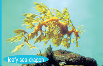
leafy sea dragon

From tropical coral reefs to the icy waters of the polar regions, the oceans are as diverse as the creatures that inhabit them. This gallery displays a sampling of the fascinating marine life found in oceans around the world.