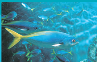
yellow back fusilier

The gently waving fronds of the underwater kelp forest provide food and shelter to a rich variety of creatures.